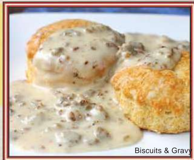
Biscuits & Gravy

Served with home fries and coffee or hot tea 7.35