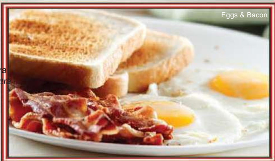
Eggs & Bacon