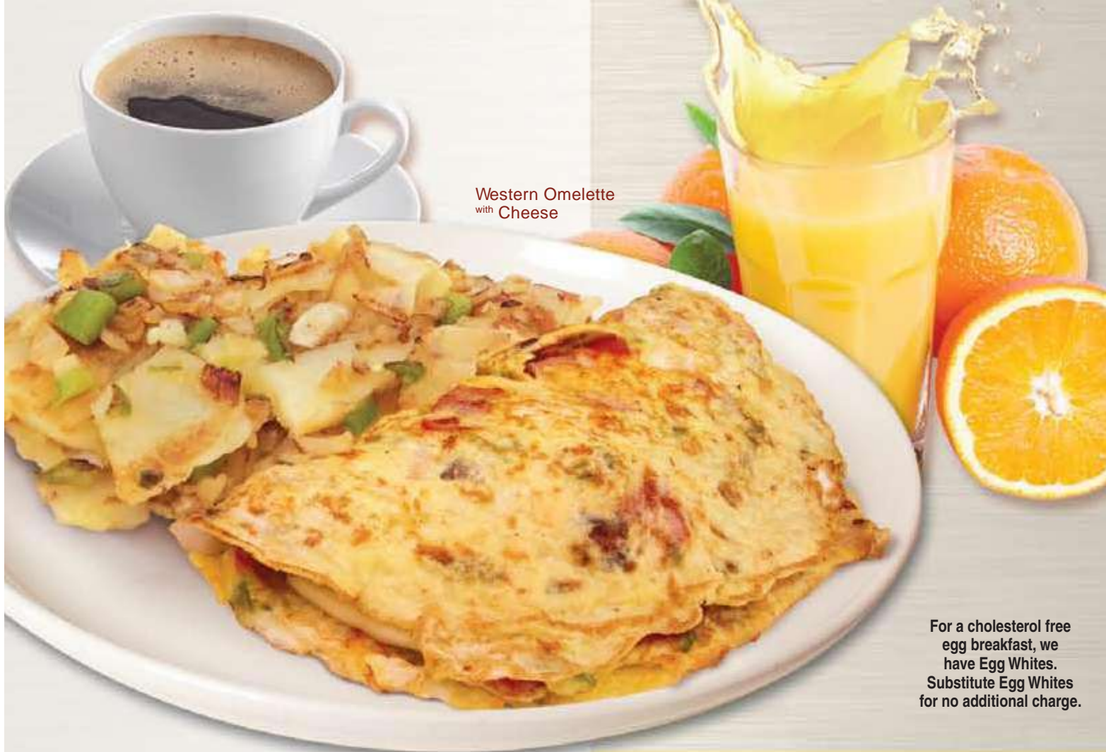
Western Omelette with Cheese

For a cholesterol free egg breakfast, we have Egg Whites. Substitute Egg Whites for no additional charge.