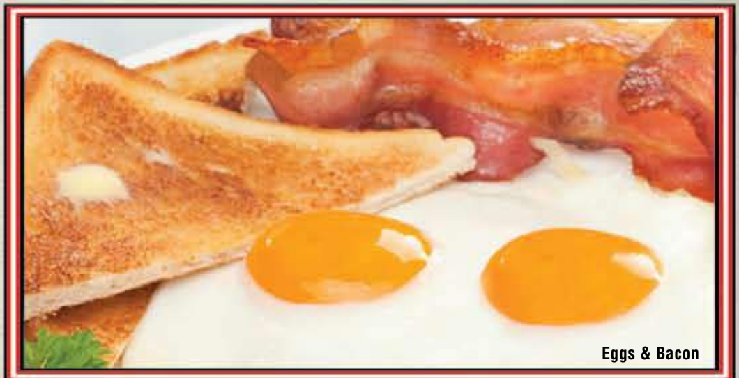
Eggs & Bacon