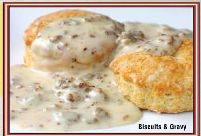
Biscuits & Gravy

Served with home fries and coffee or hot tea 7.35