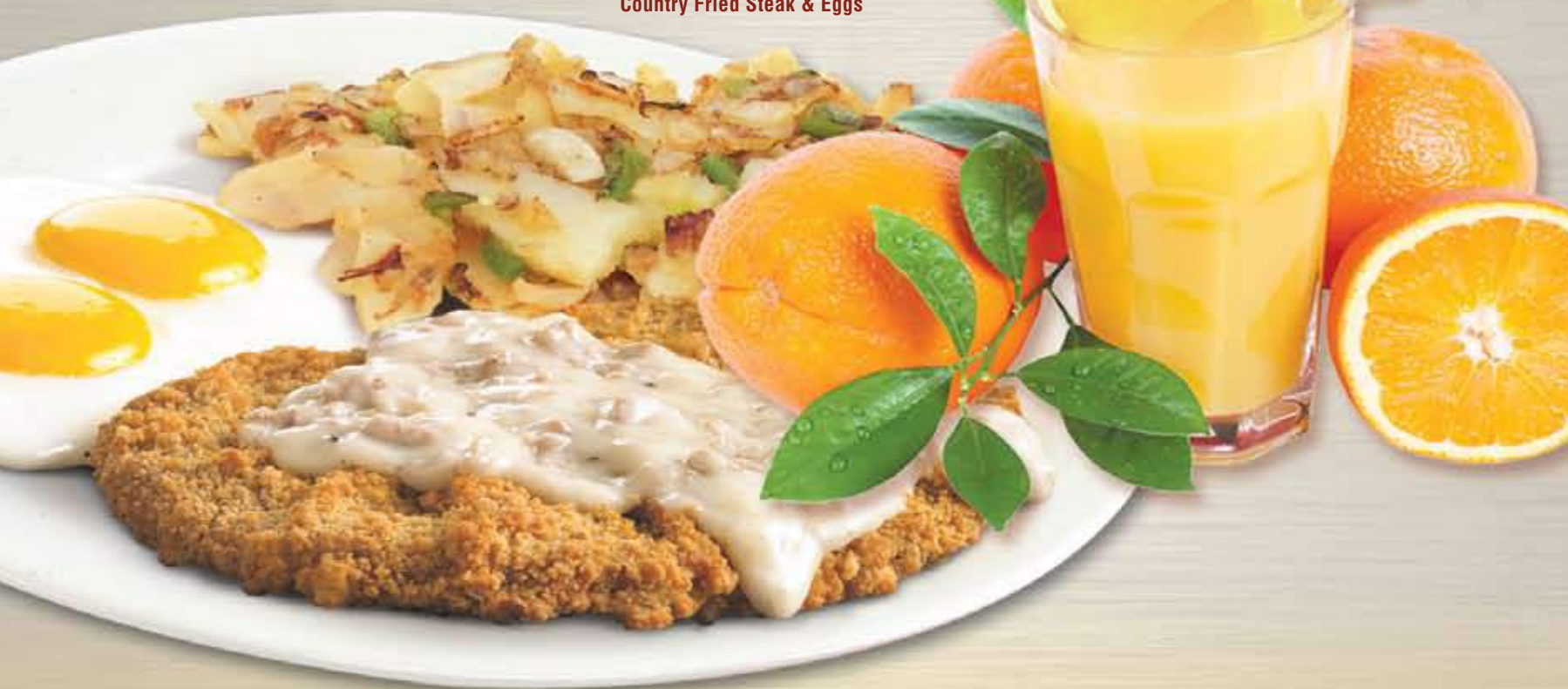
Country Fried Steak & Eggs

Country fried steak with two eggs* on an open biscuit topped with country gravy. Served with home fries or grits and coffee or hot tea 11.55