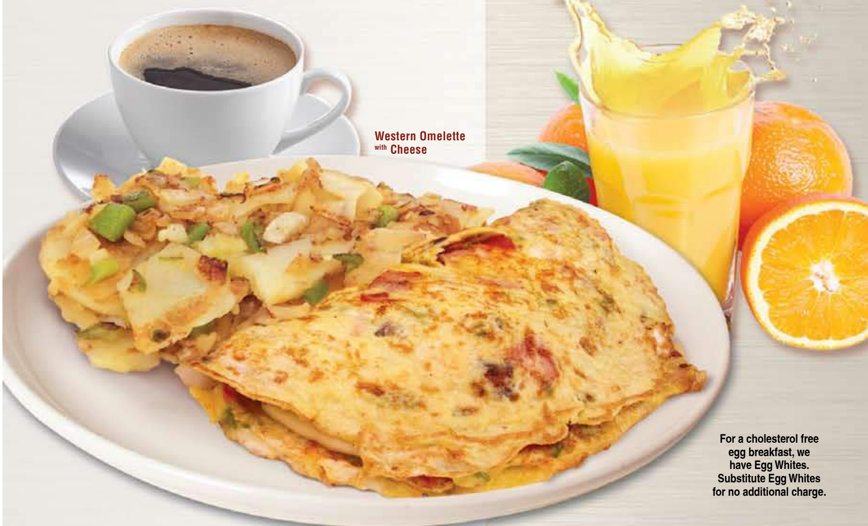
Western Omelette with Cheese

For a cholesterol free egg breakfast, we have Egg Whites. Substitute Egg Whites for no additional charge.